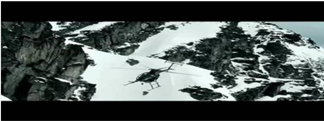
Picture 1 Cold temperatures in a steep snowy mountain

This advertisement is presented as follows: