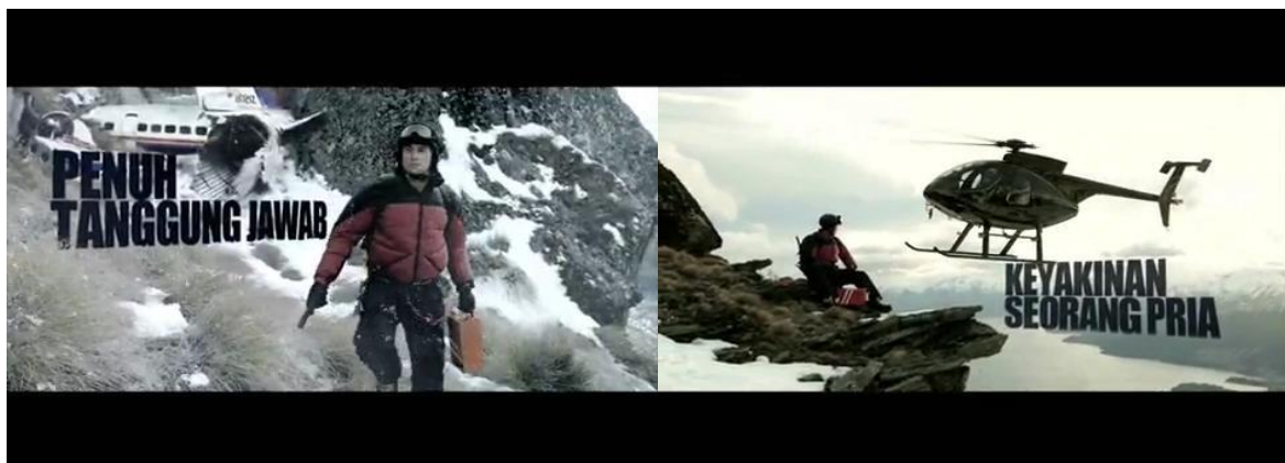
Picture 3 Full of determination and responsibility are a man's conviction

After being separated, this advertisement will be more visible in terms of sign (viewed by Pierce's theory) as shown in the following table: