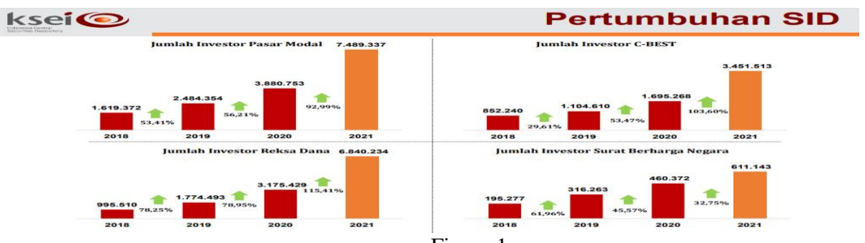
Figure 1 Investor Growth Chart in Indonesia

Recently, there have been many cases of illegal investments and investment scams in society. This can happen due to lack of information about investing in the community. Since the start of the COVID-19 pandemic, many people have wanted to invest in the capital market to protect their money against inflation. In 2020 (the beginning of the covid19 pandemic), the number of capital market investors increased by 56.21% compared to the number of investors in 2019. The number of capital market investors in 2021 increased significantly by 92.99% compared to the number of investors in 2020. The growth of the number of investors from year to year can be seen in the following graph: