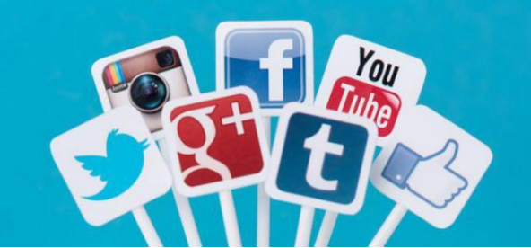
Figure 2 Social media icons