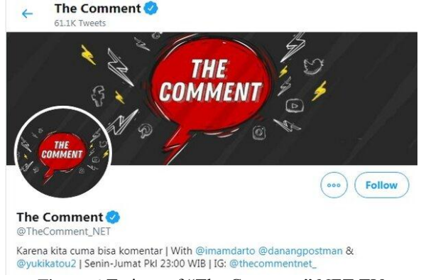
Figure 6 Twitter of "The Comment" NET TV

Twitter users follow other users. If you follow someone you can see their tweets in your twitter 'timeline'. You can choose to follow people and organisations with similar academic and personal interests to you. You can create your own tweets or you can retweet information that has been tweeted by others. Re-tweeting means that information can be shared quickly and efficiently with a large number of people.