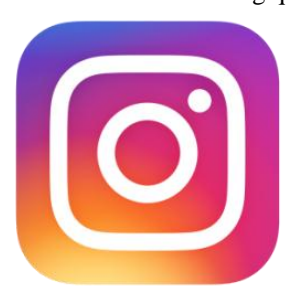
Figure 3 Instagram logo

Instagram launched on 6th October 2010 and its growth was nearly instantaneous. From a handful of users, it soon became the number one photography app gathering 100,000 users in one week, increasing to 1 million in two months. It now has over 600 million active users and is still increasing quickly.