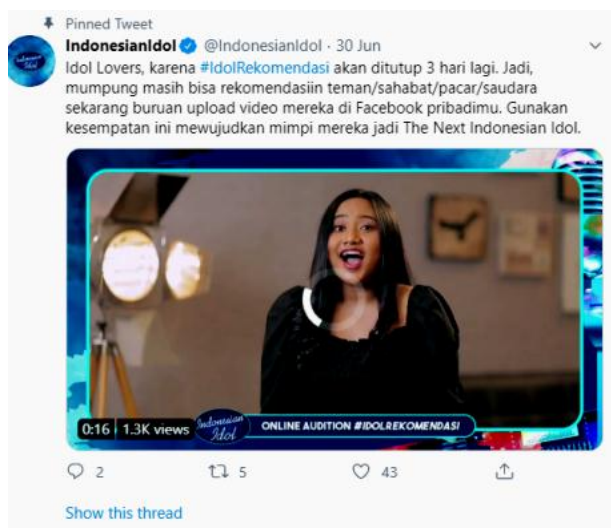
Figure 7 Twitter official @indonesianidol

Twitter has become increasingly popular with academics as well as students, policy makers, politicians and the general public. Many users struggled to understand what Twitter is and how they could use it, but it has now become the social media platform of choice for many. The snappy nature of tweets means that Twitter is widely used by smartphone users who don't want to read long content items on-screen.