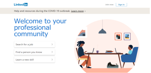
Figure 8 Website Linkedin

Linkedin has topped 315 million users globally which statistically is the majority of professionals. The research is not conclusive but I have seen estimates between 350 to 600 million business professionals on the planet, so over 50% of the business professionals on the planet are on LinkedIn. The platform has grown steadily since day one with the current rate at two new user accounts being created per second and that's more than one million new users each week joining.